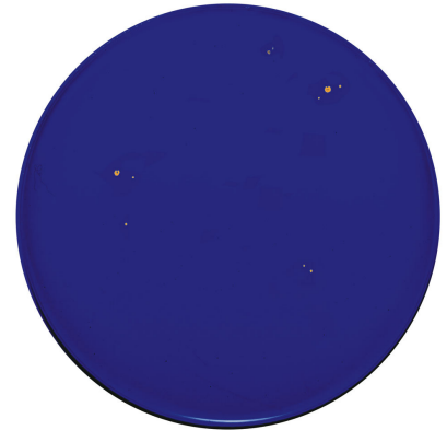
With Microban® Protection